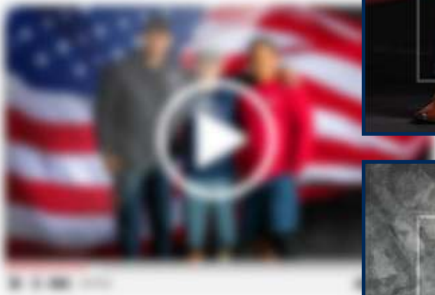
“One Moment That Stands Out?” Vincent Lynch: